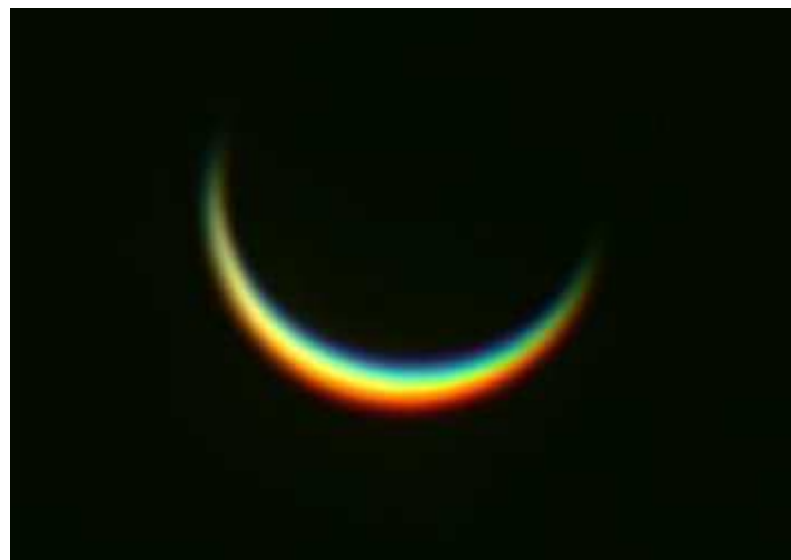
Venus on Jan. 3rd, seen through an 8-inch telescope: